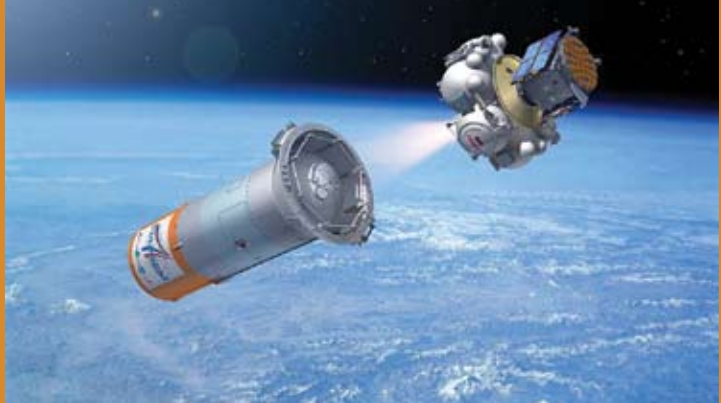
An illustration showing Fregat and a satellite separating from the rocket in space.

The European Commission wants to build Galileo completely with public money. But will the EU Council and Parliament buy it?