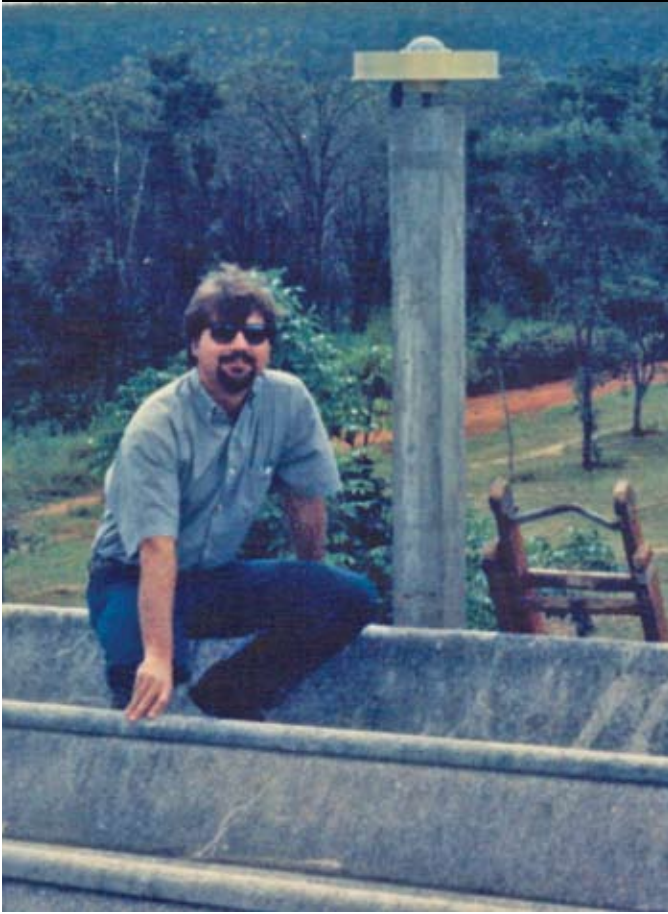
At the Brazilian IGS station in Brasilia in 1997